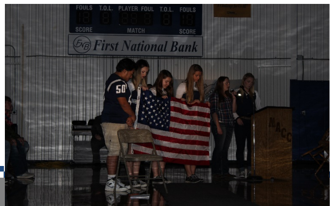
Milnor Students Honoring our Veterans at the Veterans Day Program