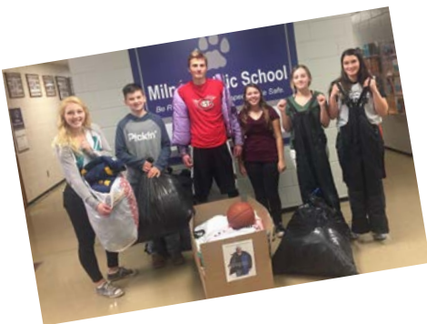
The High School Student Council held a winter coat drive

Friday, December 16th High School Music concert 7pm